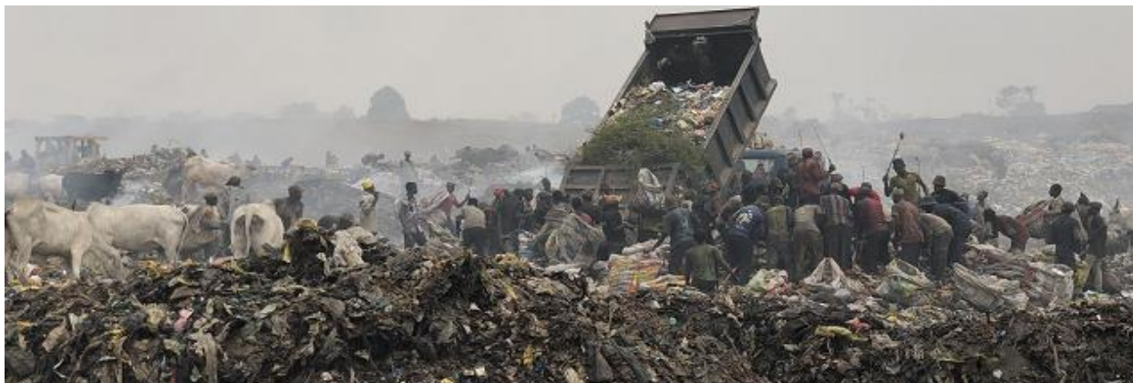
figure1: Scavenging activities at Gosa dumpsite

Protection Board (AEPB). The study showed that a total number of 520 tents exist at the scavengers' camp and which is monitored by the AEPB authority. Women and minors are not allowed in the scavenger's camp.