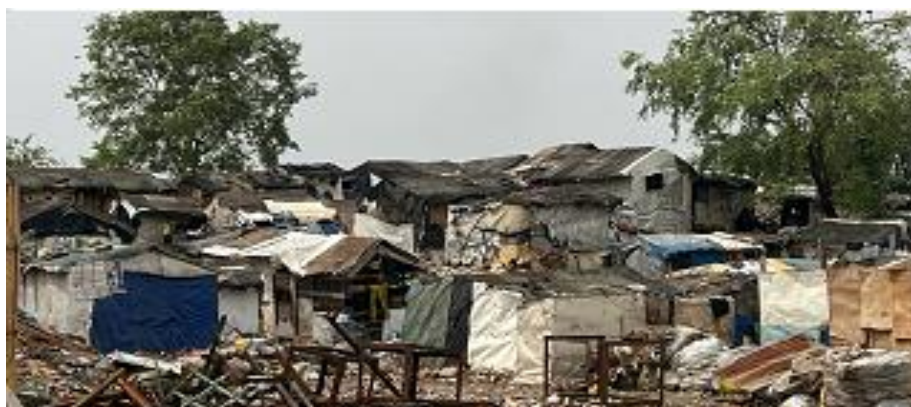
Figure2: Gosa scavenger's tents

The involvement in waste recovering and management revealed that waste pickers plays important roles in waste reduction as larger percentage of waste pickers recovered between 11 – 20 kg of waste per day over 90% of them sell the waste scavenged to waste recyclers. Different types of waste materials such as aluminium, bottles, papers, cartons, irons, plastics and metals were scavenged and sold to waste recyclers, but the majority target mainly metals especially aluminium cans and electronic waste because they have high economic value, which is sold to recycling companies at a relatively high price compared to other items. These waste pickers had even formed themselves into Abuja Environmental Protection Board recognised organisation called BolaBola. The organization was managed by elected executive members. The chairman, financial secretary, and treasurer positions were reserved for the longest-serving scavengers, but vice-chairmanship and secretary general positions were open to any registered member. These officers were paid an undisclosed monthly honoraria while every member pay #50 per week (Fridays) to the organisation purse. The organization operated without a formal